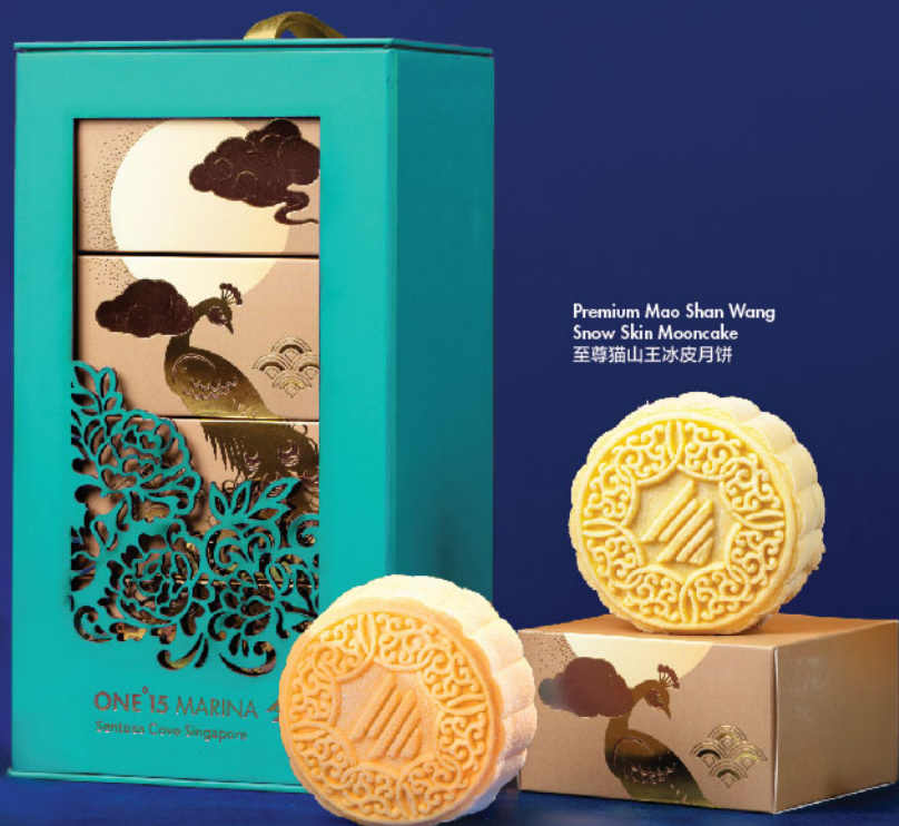
Premium Mao Shan Wang Snow Skin Mooncake 至尊猫山王冰皮月饼

Savour the rich flavours of coffee liqueur and mascarpone in our latest masterpiece of tradition and innovation with our Tiramisu Snow Skin Mooncake 提拉米苏冰皮月饼.