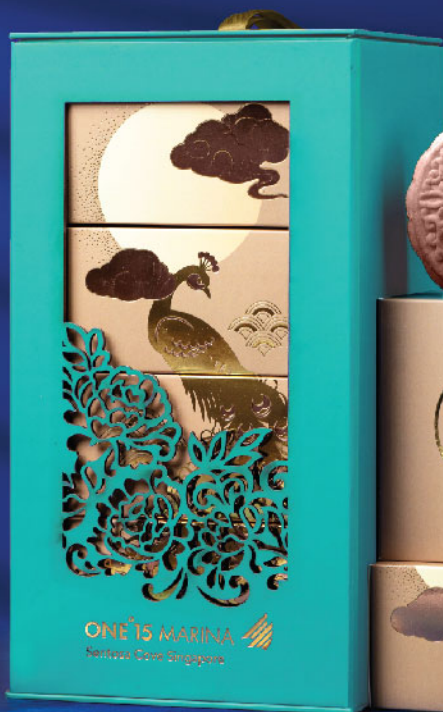
Hennessy X.O Chocolate Snow Skin Mooncake (contains alcohol) 轩尼诗X.O巧克力冰皮月饼 (含酒精)

A celebration of traditional flavours, our Pandan Gula Melaka Snow Skin Mooncake 班兰翡翠椰糖冰皮月饼 pays homage to Southeast Asian desserts with the fragrant aroma of pandan leaves delicately paired with the nutty sweetness of gula melaka (palm sugar).