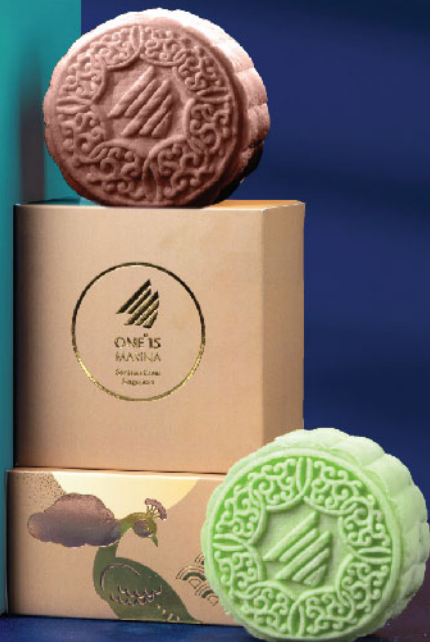
Pandan Gula Melaka Snow Skin Mooncake (contains alcohol) 班兰翡翠椰糖冰皮月饼 (含酒精)