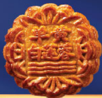
White Lotus with Single Yolk Mooncake (reduced sugar) 减糖白莲蓉传统单黄月饼